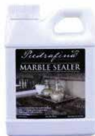
1 PINT SEALS 200 square feet